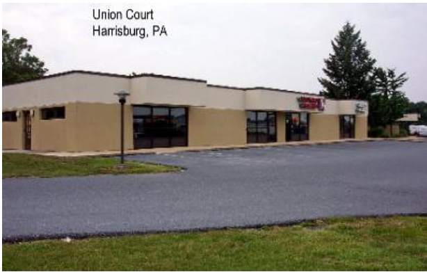
Union Court Harrisburg, PA