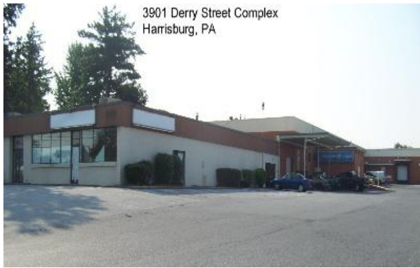
3901 Derry Street Complex Harrisburg, PA