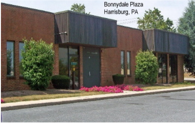
Bonnydale Plaza Harrisburg, PA