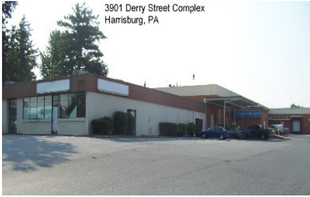
3901 Derry Street Complex Harrisburg, PA